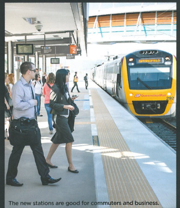
The new stations are good for commuters and business.

The rise in commuter traffic is having positive effects in the region. Local businesses report increased customers. Meanwhile enrolments have increased at the city's 10 schools and other education facilities.