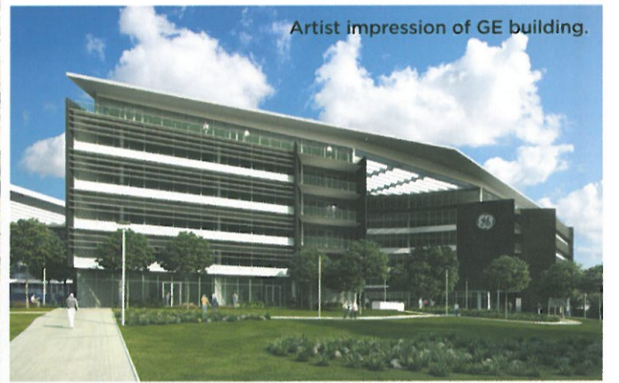
GE Australia State Headquarters under construction (above) and artist impression of the building (right) to open later this year.