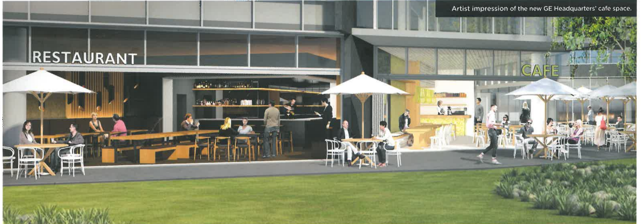
Artist impression of the new GE Headquarters' cafe space.