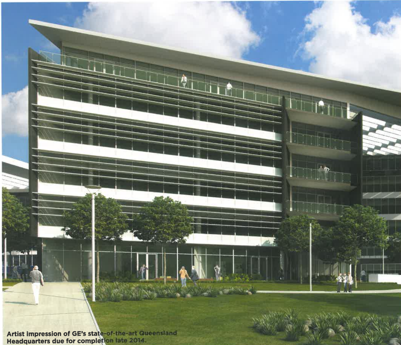
Artist impression of GE's state-of-the-art Queensland Headquarters due for completion late 2014.