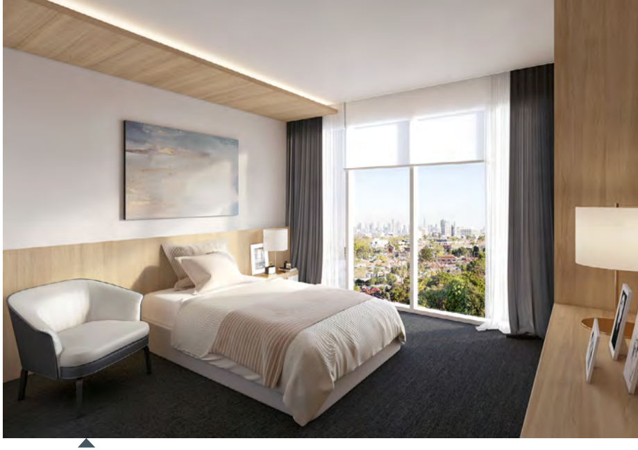
Spectacular views from the level 8 and 9 penthouses at Clifton Views.

"I am delighted with the industry-leading