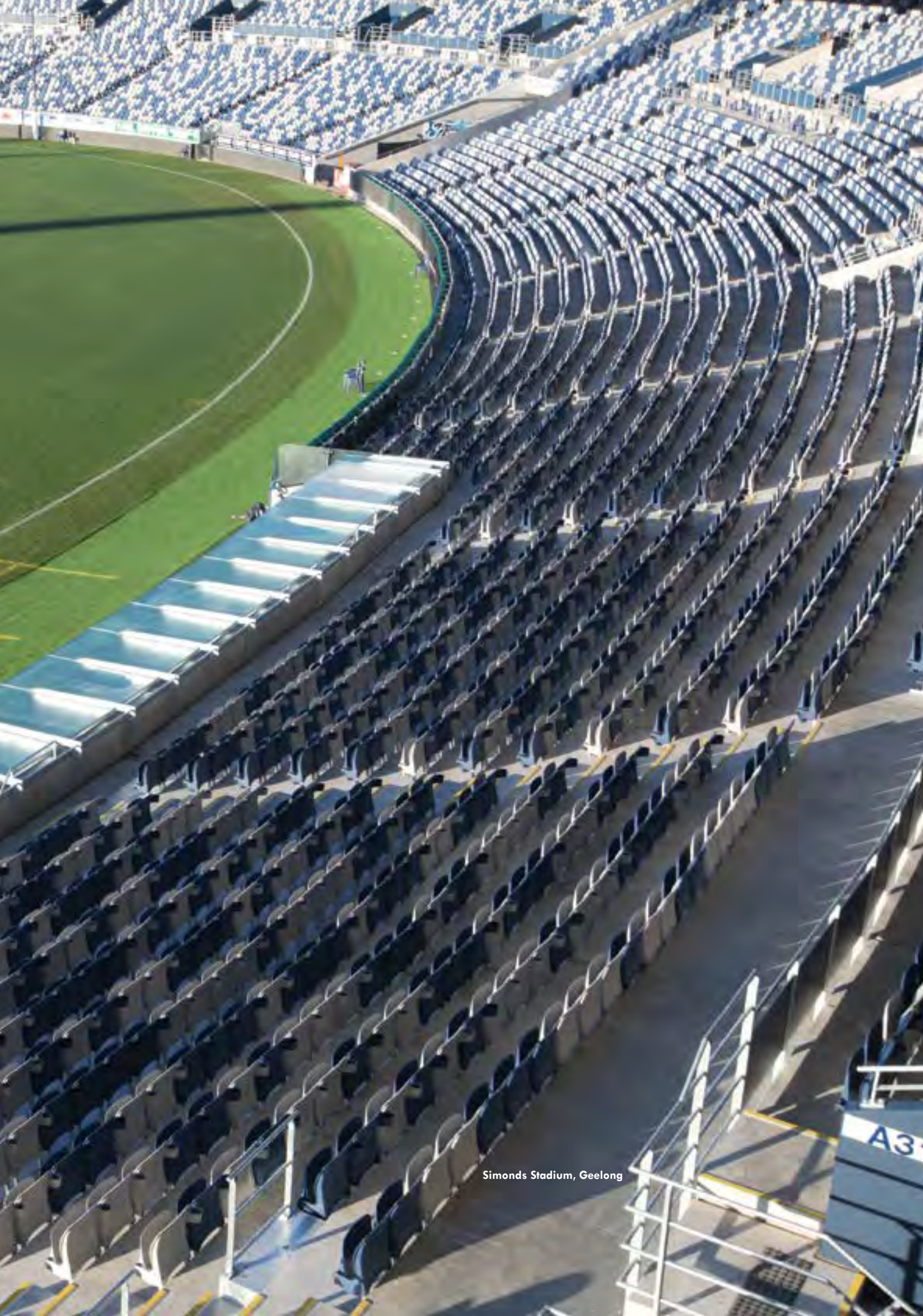
Simonds Stadium, Geelong