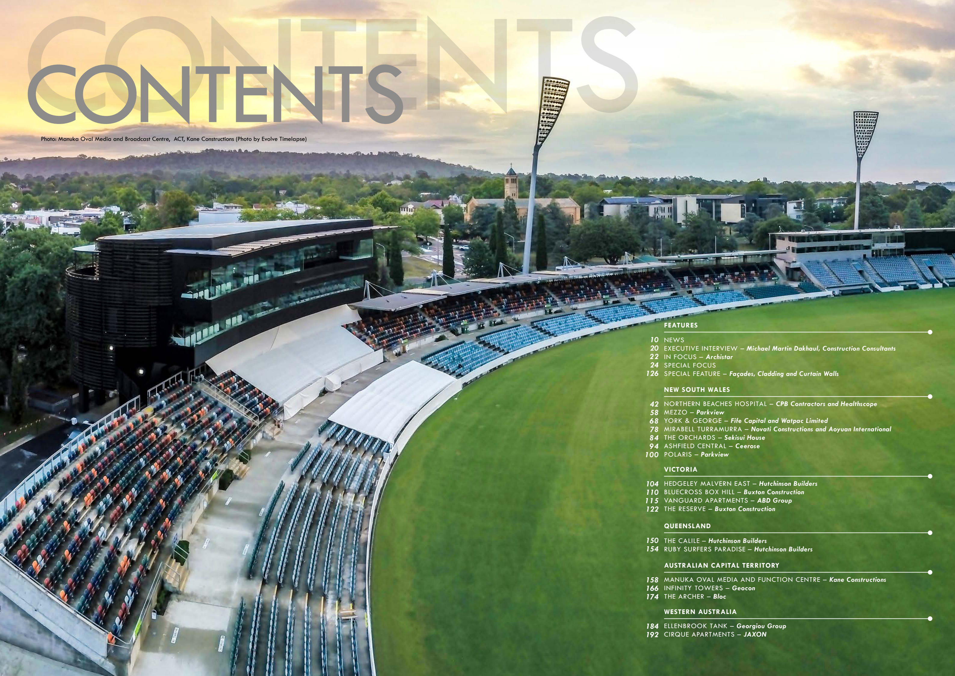
Photo: Manuka Oval Media and Broadcast Centre, ACT, Kane Constructions