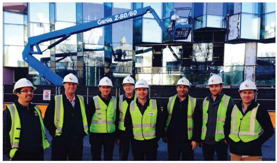
Members from Lyons Constructions who attended.

of the Geelong landscape. Its unique architecture and design will certainly be a talking point for all who visit this location. The library facilitates archiving of museum pieces, there are conference and function rooms available for hire as well. This will also house staff from the City of Greater Geelong. This is an exceptional building, well worth a visit upon its completion.