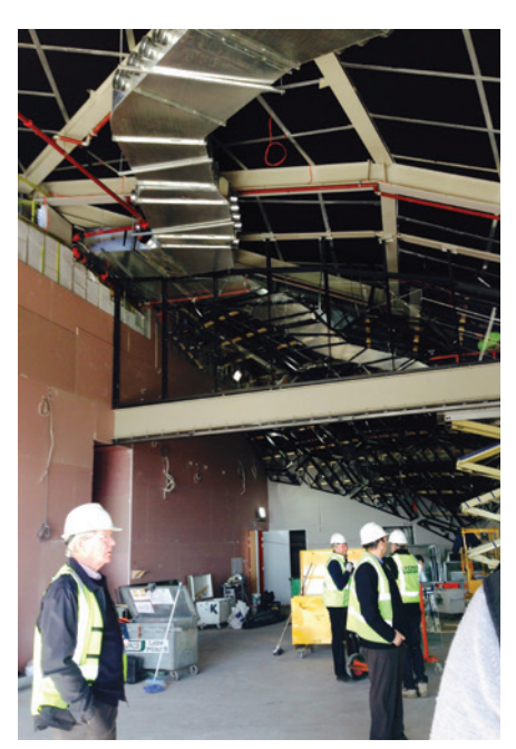
Inside the roof design.