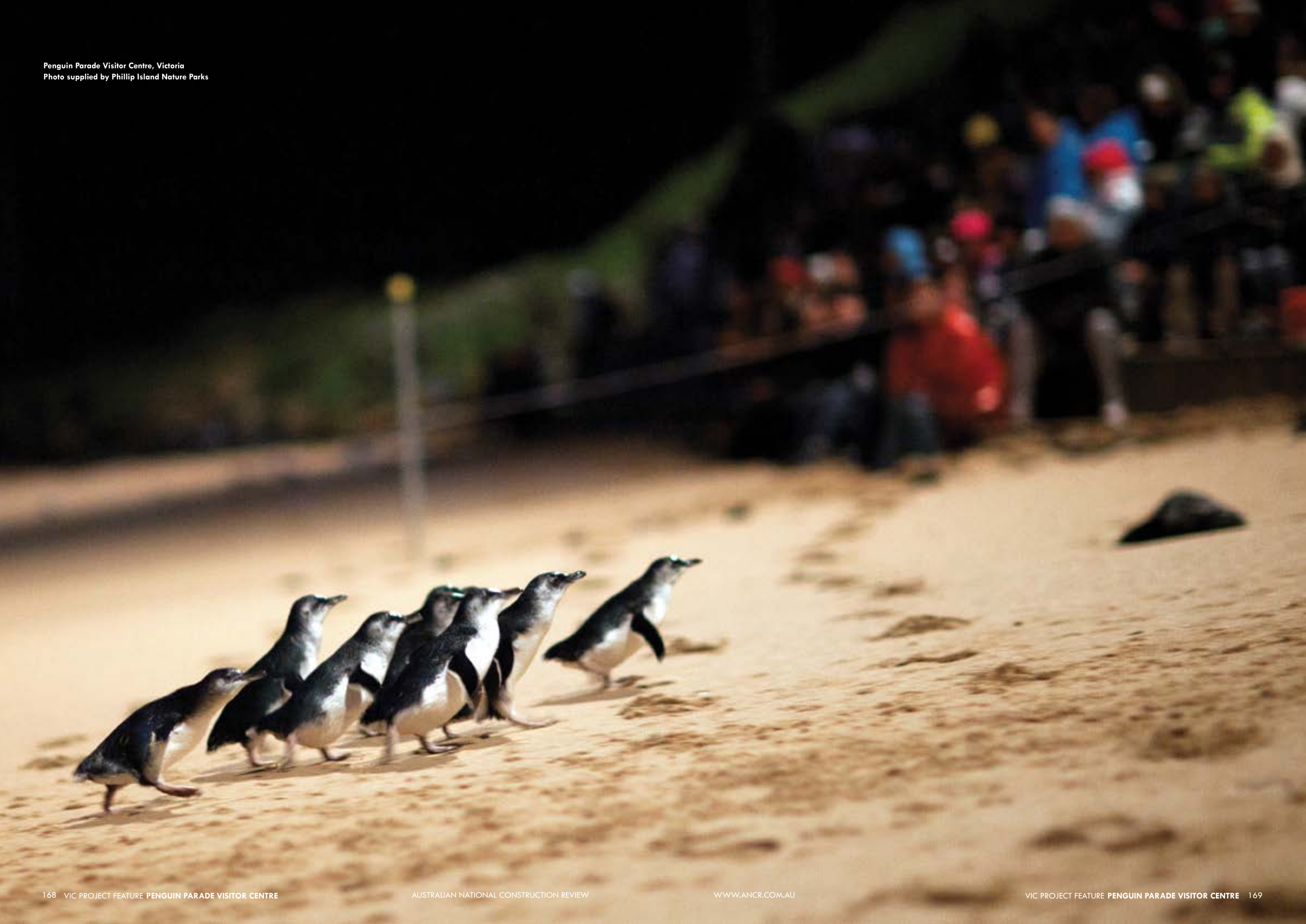
Penguin Parade Visitor Centre, Victoria